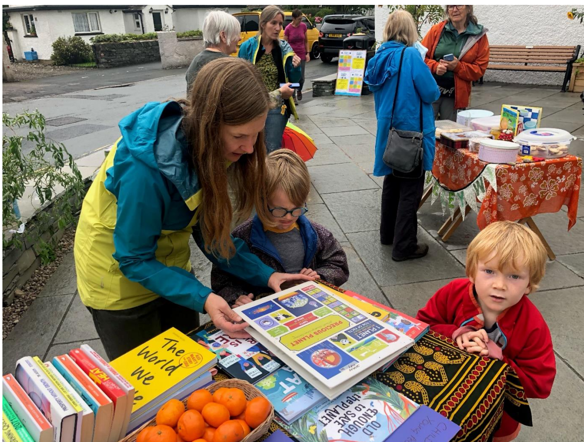
'Green library' - Saturday 18 th September 2021 @ Jack's Corner, Staveley