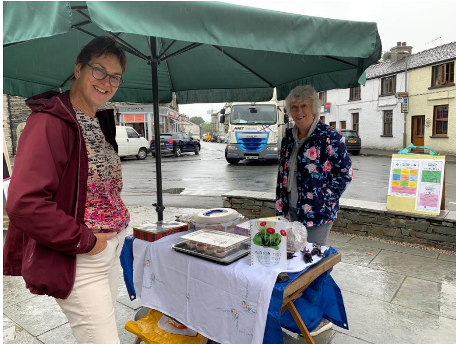
Women's Institute stand of free, delicious refreshments!